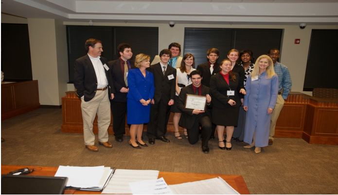
State Champions with Judges.

From a field of 70 teams, narrowed down to 10 State Finalists, only 1 could be State Champion. On Saturday, March 20, Gray Stone Day battled it out with Raleigh Charter (Silver) in the final championship round at Campbell University School of Law. Gray Stone Day prevailed and will now prepare the prosecution and defense of a new case for the National High School Mock Trial Championship competition in Philadelphia, Pennsylvania, May 6-9, 2010.